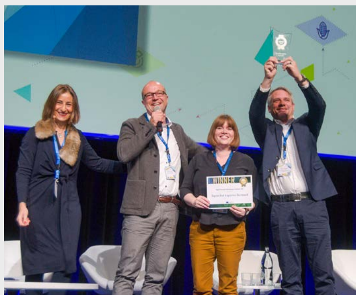
Awarded: The Digital Hub Logistics Dortmund has won the first Champions Challenge of European DIHs in 2019.

on the realization of multidisciplinary and pan national innovation concepts. In addition, the hub wants to enable SMEs in particular to get to know new European partners and integrate them into innovation projects. At the same time, the actors are committed to providing companies with access to independent and active participation in European bodies and initiatives.