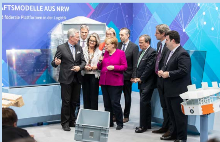
Research meets politics: The Silicon Economy is presented at the German government's digital summit.

that pay attention to the "big picture" of fully digital logistics. These flagships focus, for example, on testing and deploying new technologies, determining technology acceptance, and designing innovative products and services that make digital business models possible. Industrial value creation is being rethought here: open innovation and agility are the ground rules for collaboration between partners in the flagships. The broad participation of industry, in particular small